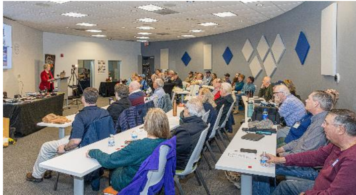
Drone photography demonstration