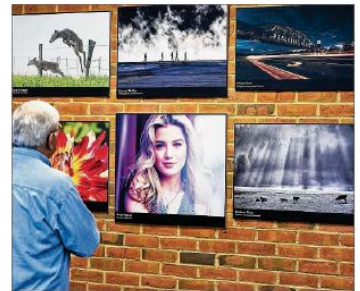
The Peachtree Corners Photography Club photo exhibit includes a Hero Wall.

"We thought about the pandemic, what we went through and how everyone felt being cooped up inside, so we wanted something hopeful," added club