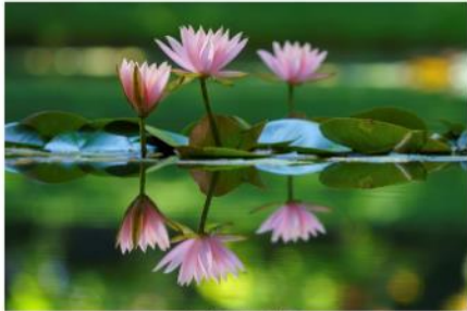
"Triple Reflections" by Vipul Singh

The Peachtree Corners Photography Club is hosting its first Juried Print Exhibition. The theme of the exhibition is "Light Is Hope," and it is displayed at the Peachtree Corners Library at 5570 Spalding Drive. The exhibition consists of 100 photographs.