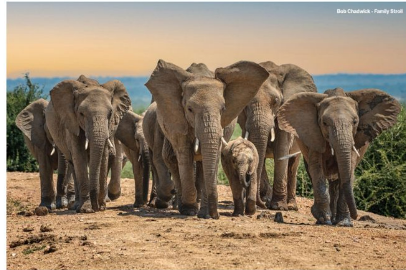
Bob Chadwick - Family Stroll

As photography clubs go, the Peachtree Corners Photography Club is relatively young, having been founded in 2017. The group's purpose is to educate, encourage and expand the photographic knowledge and capabilities of its members.